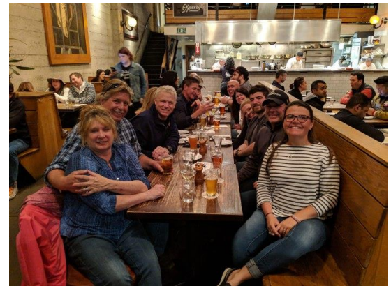
The gang at 21 st Amendment