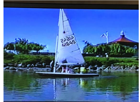
A Laser sailing in front of the clubhouse. Note the red roof on the club!

All photographs on this page were captured From an old home video. Maybe someday I Will get the guts to upload it!