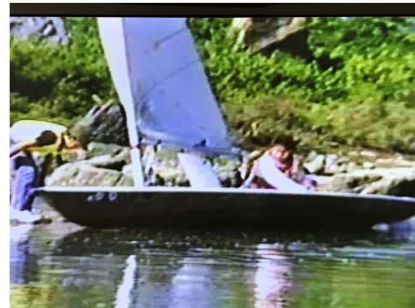
A little too close to the rocks there! Gotta get out and push.