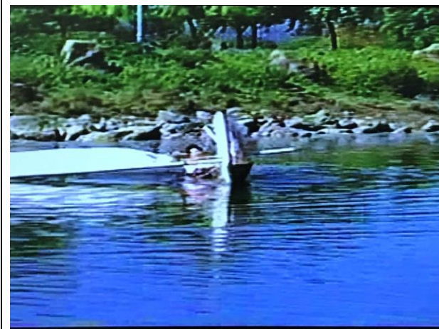
And that's why we called it junior swimming!